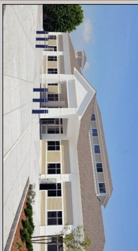
Louis D. Pettine Transportation Center