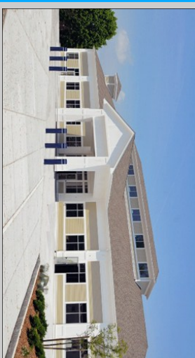
Louis D. Petrine Transportation Center